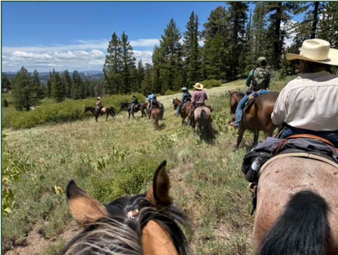
Riding down from Cowboy Heaven