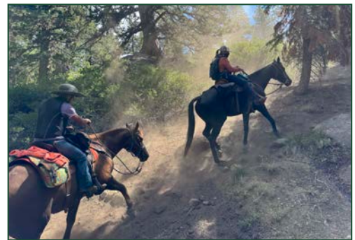
Raising dust on Red Horse trail.