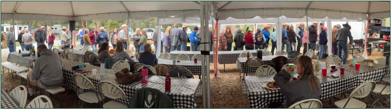
Lines for dinner and breakfast formed up in seconds. No one was late to a meal if they could help it.