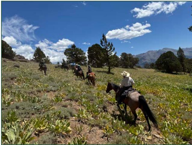
Roaming mountain meadows.