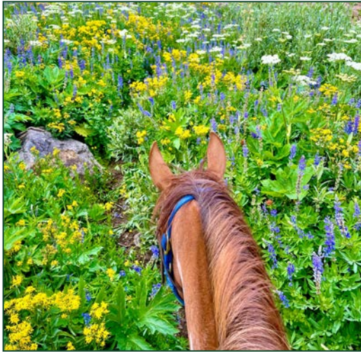
The blooms were brilliant on Eagle Peak Trail.