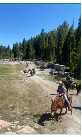
Leaving staging at Leland Meadows.