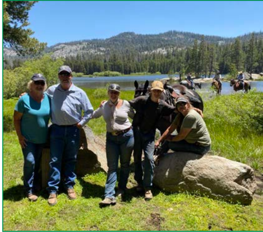
At lunch stop. Horses and riders love to wade in the Herring Creek reservoir.