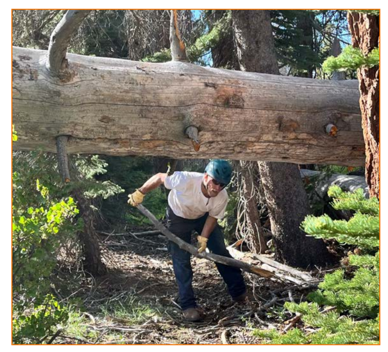
Lance preparing to take down a large widow maker hanging over the trail.