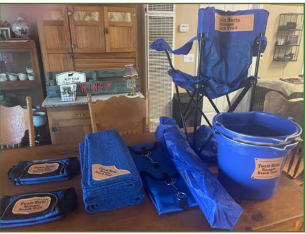
Awards and prizes for the event have arrived!