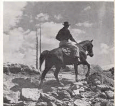
Panoramic views from high above timberline

The balance to be paid upon arrival in camp. Each participant will be responsible for his horse, its transportation and its care.