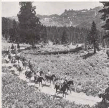
Trails lead through mountain meadows beneath snow capped peaks

Sponsored by TWAIN HARTE HORSEMEN, Inc. Twain Harte, California