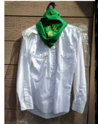
White Shirt and Green Bandana

Riders should wear new dark blue jeans with no bling or rips. Brown belt and brown boots. New natural leather gloves. White straw hat or riding helmet. Long sleeve white shirt. Keep shirt clean by wearing something else while getting ready and put the shirt on at the last moment. Green bandanas will be provided.