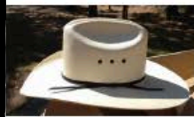
White Straw Hat

Horses, Tack and Riders in the parade all need to be neat and clean.