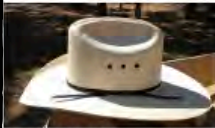
White Straw Hat

Riders should wear new dark blue jeans with no bling or rips. Brown belt and brown boots. New natural leather gloves. White straw hat or riding helmet. Long sleeve white shirt. Keep shirt clean by wearing something else while getting ready and put the shirt on at the last moment. Green bandanas will be provided.