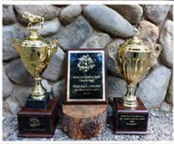
THH Motherlode parade awards include: 2008 Sweepstakes, 2018 Sweepstakes and the Longevity award.