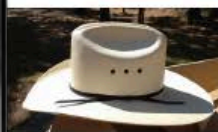
White Straw Hat

Horses, Tack and Riders in the parade all need to be neat and clean.