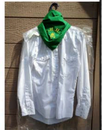
White Shirt and Green Bandana

Riders should wear new dark blue jeans with no bling or rips. Brown belt and brown boots. New natural leather gloves. White straw hat or riding helmet. Long sleeve white shirt. Keep shirt clean by wearing something else while getting ready and put the shirt on at the last moment. Green bandanas will be provided.